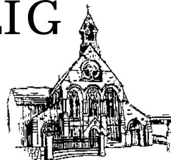
ST. MARY & ST. JOHN STATION ROAD