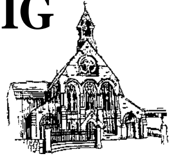
ST. MARY & ST. JOHN STATION ROAD