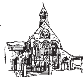
ST. MARY & ST. JOHN STATION ROAD

God promised his people a future of great blessings where death and mourning would be no more. Christ came to issue God's final invitation to this future. Some rejected it, others accepted it but then made light of it. what have we done with our invitation?