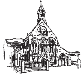
ST. MARY & ST. JOHN STATION ROAD