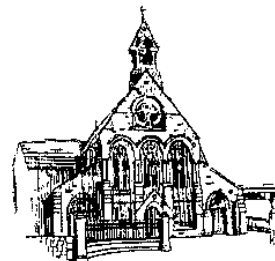
ST. MARY & ST. JOHN STATION ROAD