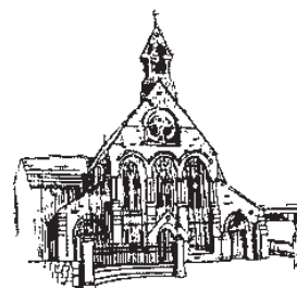
ST. MARY & ST. JOHN STATION ROAD