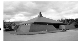
Christ Our Light Innishmore

We come together on Sunday to listen to the scriptures and to have them explained. Here it is God who speaks to us through his Son. His Spirit continues to work on us to inspire us with his message of freedom and encouragement for all in need.