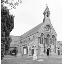
St. Mary & St. John Station Road