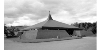
Christ Our Light Innishmore

Jesus as a man like us, wept for Lazarus his friend, as eternal God he raised Lazarus from the dead, in his love for us all, Jesus gave us the sacraments to lift us up to everlasting life.