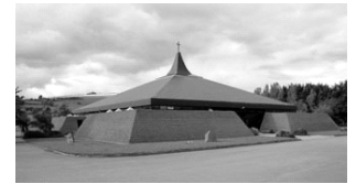
Christ Our Light Innishmore

The original relationship of man and woman in marriage was to be that of perfect union, a union brought about by God himself. In today's gospel, Jesus restates this ideal understanding of marriage and calls for it to be taken seriously