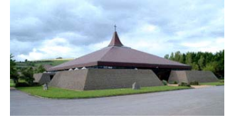
Christ Our Light Innishmore

God is mercy unlimited - that is for those who are ready to turn from their sin to seek his love. Today's readings remind us that it is not God who limits his love. It is either our complacency or our fear which refuses to trust in so great a love.