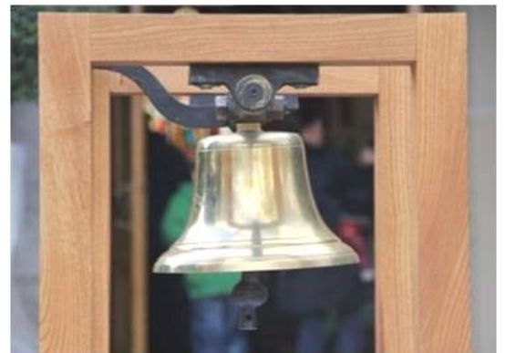
The Congress Bell