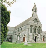
St. Mary & St. John Station Road