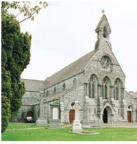
St. Mary & St. John Station Road