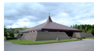
Christ Our Light Innishmore

A wedding is a time for joyful celebration; it is a time of hope and promise. According to John the wedding at Cana marked the beginning of Jesus' ministry. It showed the joy and plenty that his coming brings because in him, God's promised love is present reality.