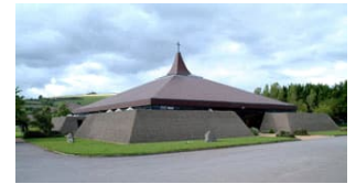
Christ Our Light Innishmore

We come together on Sunday to listen to the scriptures and to have them explained. Here it is God who speaks to us through his Son. His Spirit continues to work on us to inspire us with his message of freedom and encouragement for all in need.