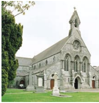
St. Mary & St. John Station Road